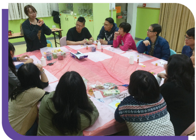
▲ 生命反思工作坊 Life Recall Workshop