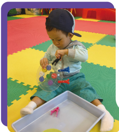
▲ 小朋友學習專心與專注。 Group-based concentration and focus development for children.