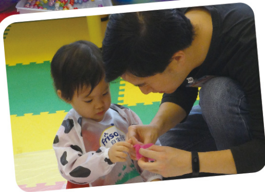
▲ 感覺統合與專注力訓練Playgroup Attention and Sensory Integration Playgroup