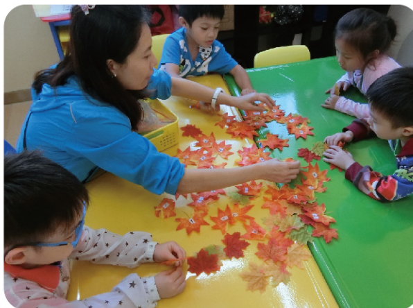
▲ 「專注力我都得！」活動小組 The Attention Group