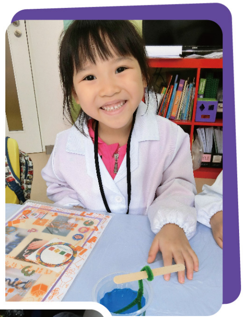
▲ STEM玩轉科學實驗室 STEM Play Scientist

近年社會對兒童特殊學習需要的關注度日漸增加，家長對這方面的認知亦隨之增強，有見及此，中心亦於部分課程內加入相關元素；於2017-2018年度共舉辦了12個專注力課程，提供了96課堂，共有82位小朋友參加。